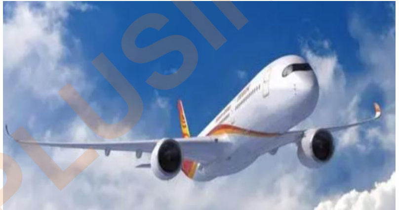
Air transport (No magnet/Lithium free battery)