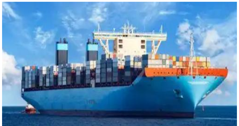
Ocean shipping (Shock and moisture resistance)